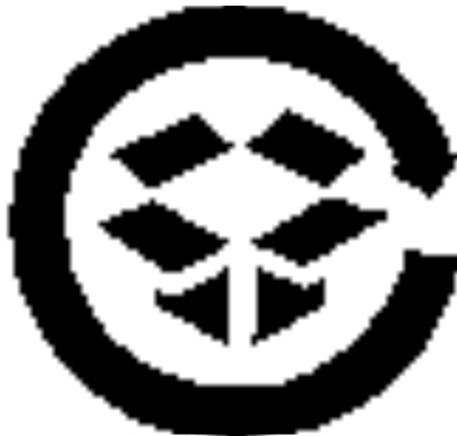
Exhibit 6 “Corrugated Recycles” Symbol and Statement