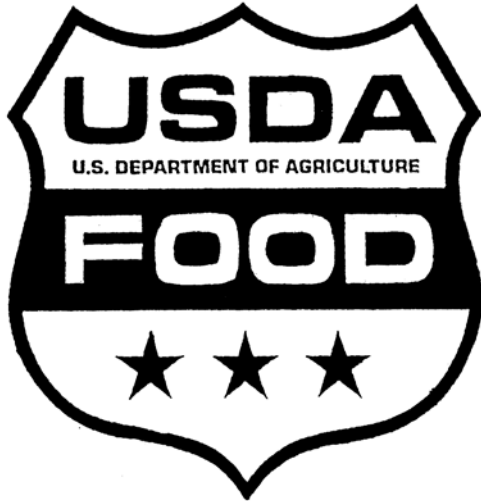
Exhibit 2 – Alternative Label for Shipping Containers (Includes all Required Information)