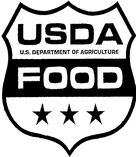
Exhibit 3 - Sample Alternative Label for Shipping Containers (Includes all Required Information)