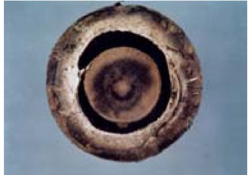
Cull – Diseased Stem – Over mature cap

MSH-CP-5 February 1991 (Previously folder of defects, 1964)