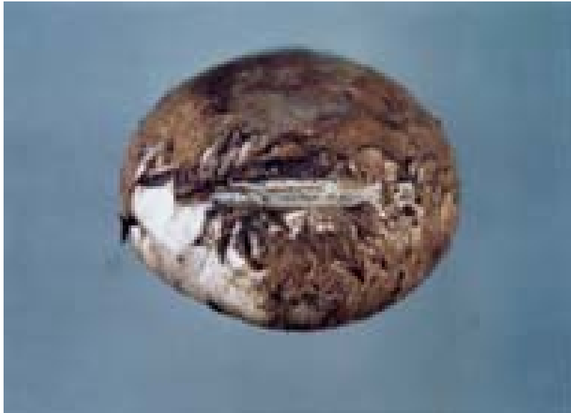
U.S. No. 2 – Mechanical Damage