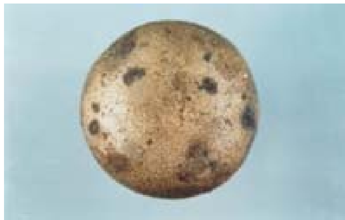
Cull – Disease Spots