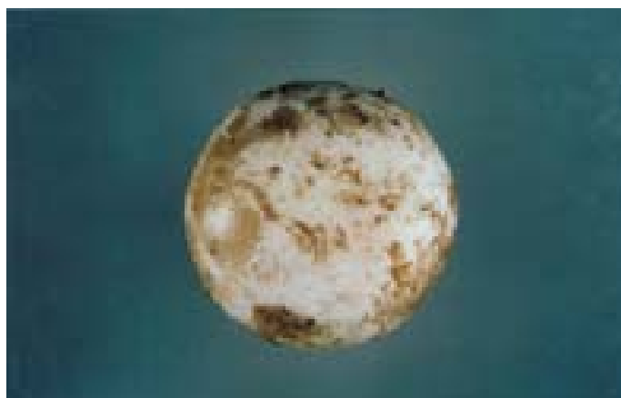
U.S. No. 1 – Slight Discoloration