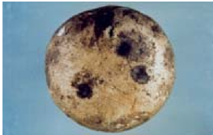
Cull – Disease Spots