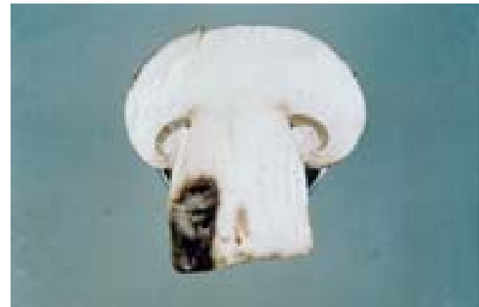
U.S. No. 1 (cap) – Cull (stem)