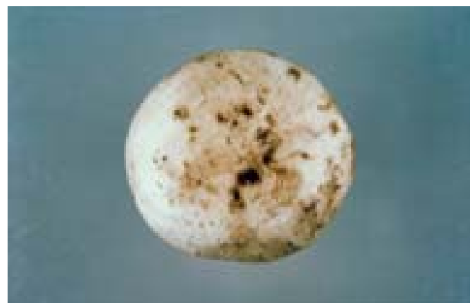
U.S. No. 2 – Disease Spots

MSH-CP-2 February 1991 (Previously folder of defects, 1964)