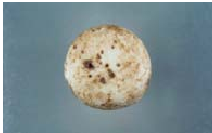
U.S. No. 2 – Disease Spots