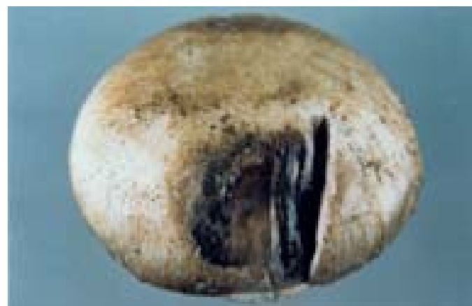
U.S. No. 2 – Mechanical Damage

MSH-CP-3 February 1991 (Previously folder of defects, 1964)