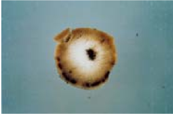
Cull – Disease Stem