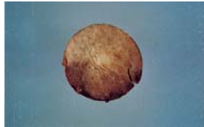
Cull – Discolored Stem

MSH-CP-1 February 1991 (Previously folder of defects, 1964)