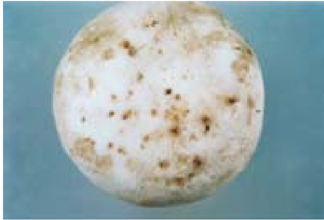
U.S. No. 2 – Disease Spots