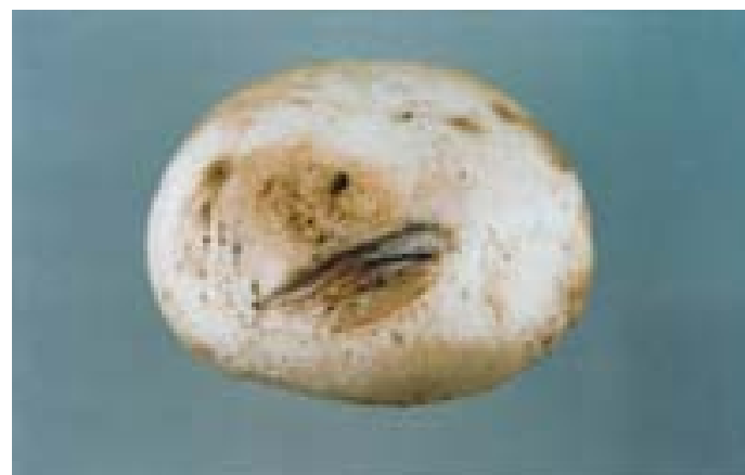
U.S. No. 1 – Mechanical Injury