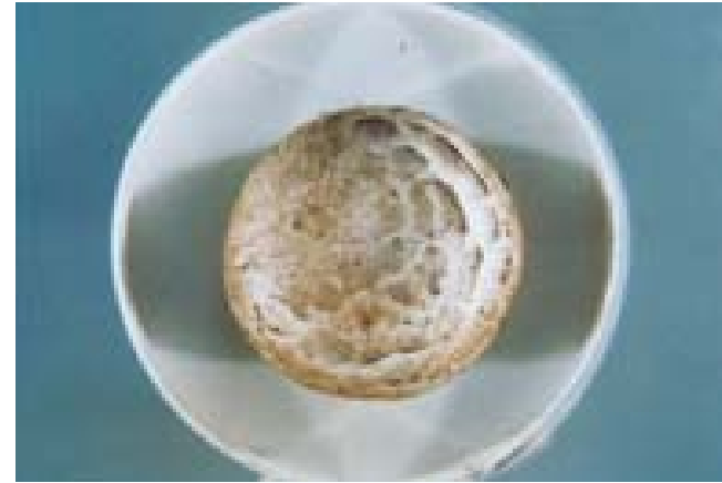
U.S. No. 2 -- Feathering