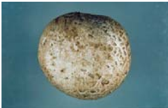
U.S. No. 1 – Feathering