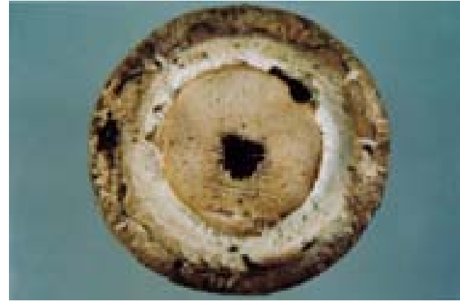
U.S. No. 2 (cap) Provided disease not in base of cap Cull (stem) disease