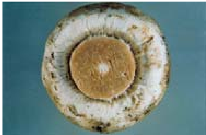
U.S. No. 1 (cap) Provided disease not in base of cap Cull (stem) disease