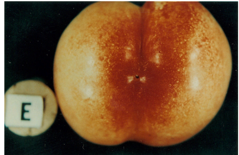
2 Nectarines – D and E; 2 views of each. Both Lower Limit Misshapen (But Not Badly Misshapen)

NECTARINES, C-2 SHAPE MAY 1990 (Previously no date)