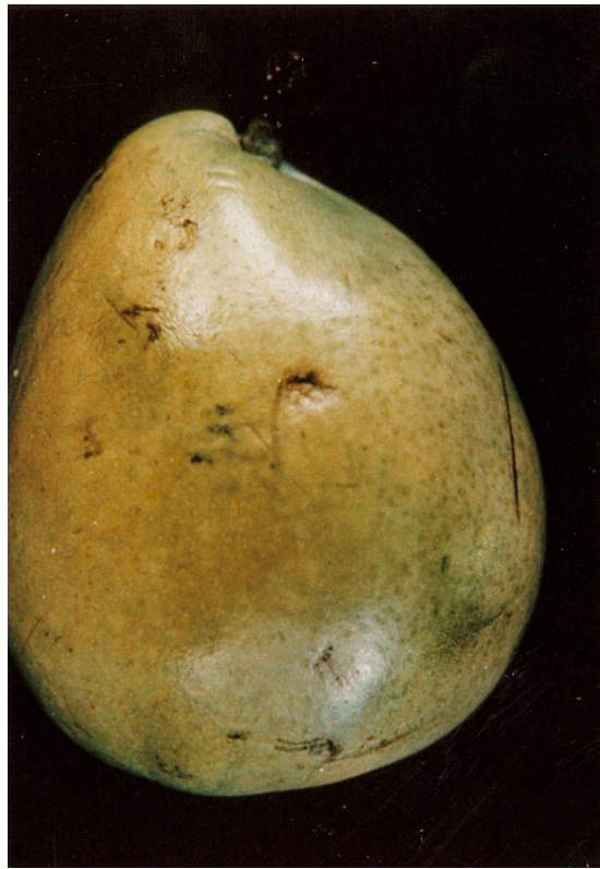
Fairly Well Formed Lower Limit U.S. No. 1