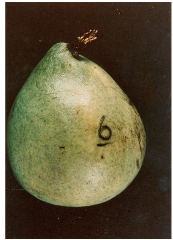
Not Seriously Misshapen Lower Limit U.S. No. 2

These photographs illustrate shape of D'Anjou pears with folded or slanted stem end.