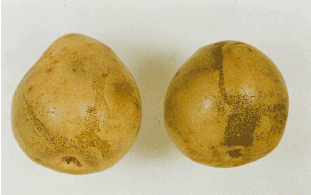
Left: Moderately scattered Right: Heavily concentrated

C-1 PEAR PSYLLA MAY 1990 (Previously January 1964)