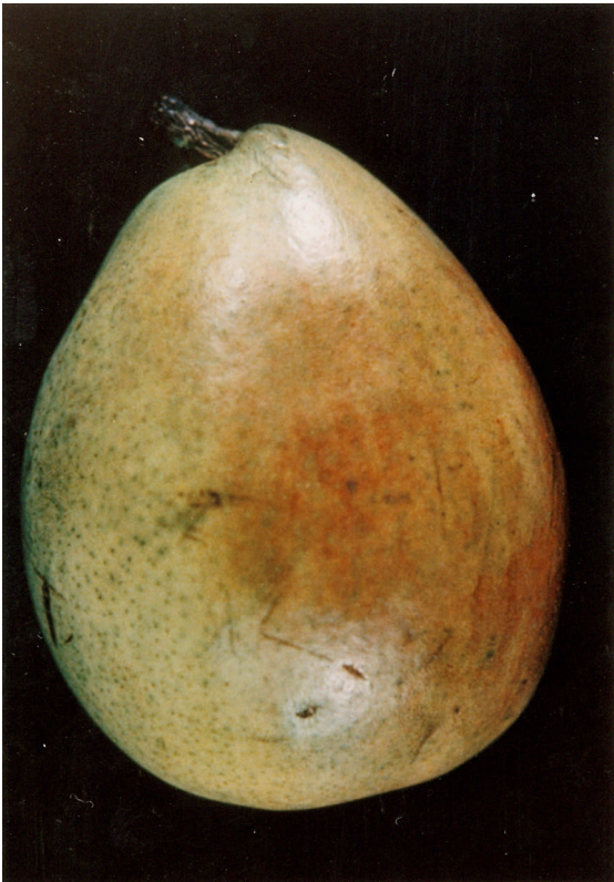
Well Formed Lower Limit U.S. Extra No. 1