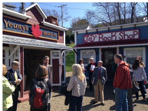
Figure 2 - Tionesta’s Market Village is home to 11 small shops. Credit: Renaissance Planning

Today Tionesta and Marienville are looking at new ways to boost their local economies breathe new vitality into their downtowns. Tionesta transformed the fire-damaged block into a small retail business incubator known as the Tionesta Market Village. The Market Village provides affordable space for small retail startups with the hope that they will eventually move into permanent space in vacant storefronts. The Market Village consists of 11 small sheds that resemble historic storefronts organized around a central green. The shops are open on the weekends during the spring, summer, and fall tourist season. The Market Village has been such a success that all sheds are occupied and the town had a waiting list of four potential vendors in April 2015.