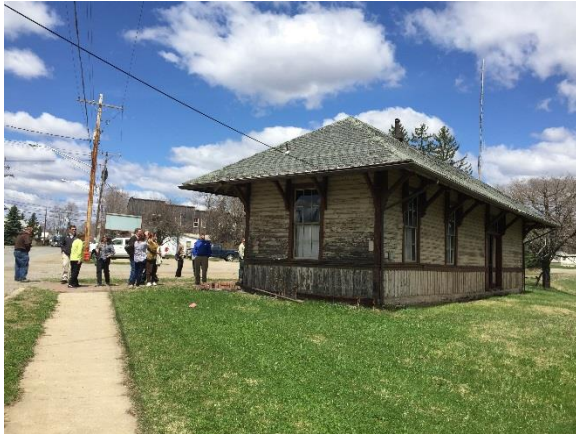
Figure 3 - Marienville is planning to renovate its historic depot as a hub for trail users and visitors from out of town.

comes with a historic depot downtown that Marienville plans to transform into a hub for trail users. The trail with its tourism benefits and boost to the town's quality of life will be a major source of economic growth.