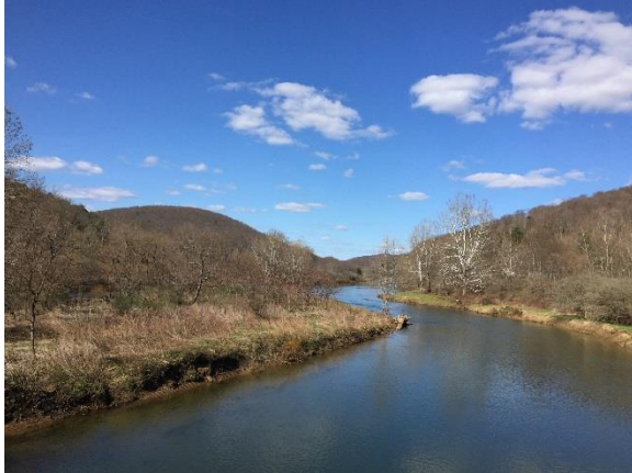
Figure 1 - Forest County is known for its beautiful forests, hills, rivers, and streams.

These timber and gas industries remain important in 2015. Much of this activity happens within the Allegheny National Forest, which covers about half the county. But farming has seen a precipitous decline as many farms became small “camps” of about one half acre. The county has about 6,000 of these camps where people come to hunt, fish, disconnect, recharge, and enjoy nature and family time. Throughout the county there is strong interest in heritage - whether historical, cultural or arts related.