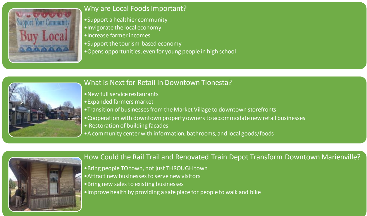
Figure 5 - Thoughts on the Importance of Local Foods and their Hopes for the Future of Tionesta and Marienville

Their responses, which informed these visions, are summarized in Figure 5 below.