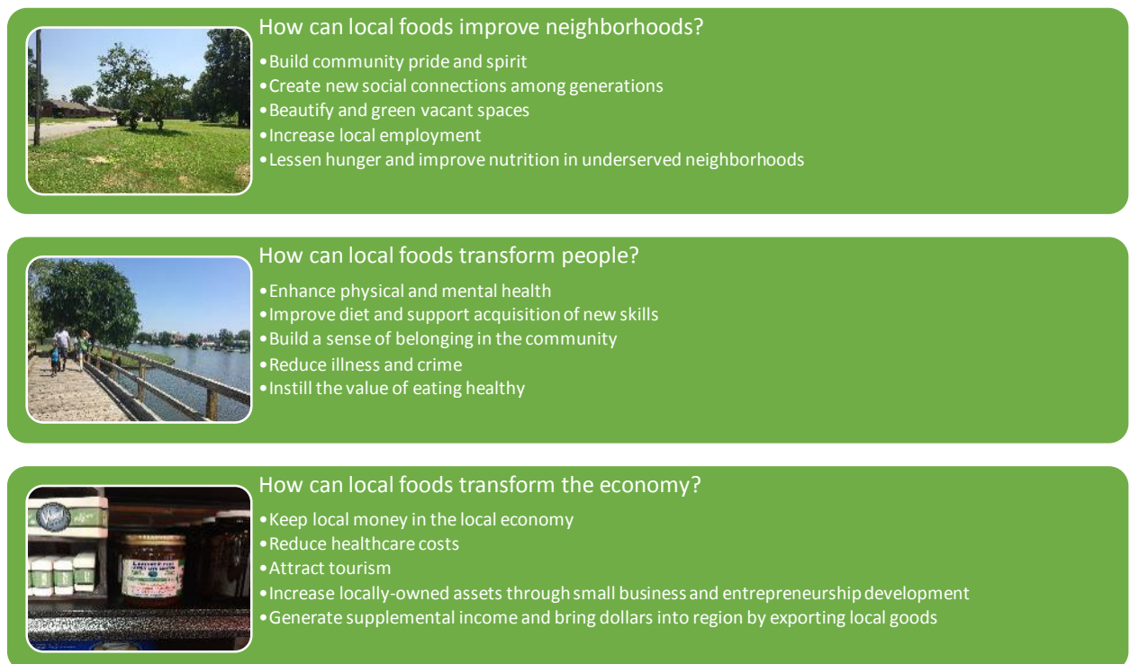
Figure 2 - Thoughts on How Local Foods can Transform Neighborhoods, People, and the Economy

The responses are summarized in Figure 2 below.