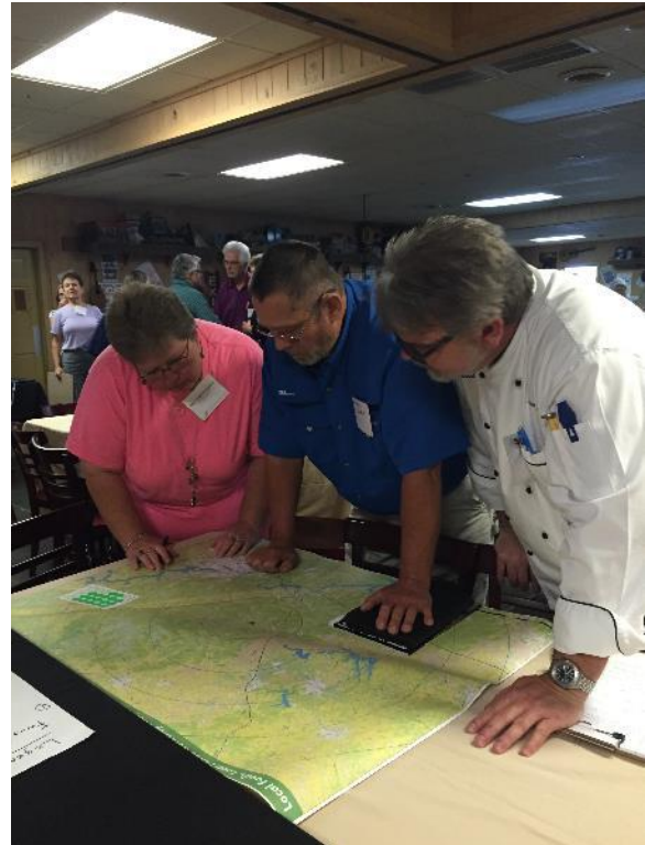
The workshop attracted a large and diverse crowd of local, regional, state, and federal representatives

Figure 1 is a summary of the workshop process.