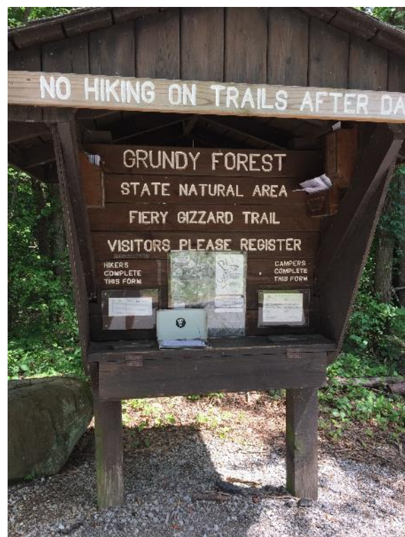
The Fiery Gizzard Trail is one of many popular outdoor destinations that attract people to the area

There are reasons for optimism though. Grundy County is tackling its health challenges head on through new programs aimed at increasing access to healthy local foods. For example, the Grundy County Health Council and Diabetes Coalition is working