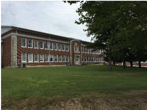
The community is planning to transform its old high school into a Learning and Development Center

Tracy City is also working to improve health and economic opportunity by making the community more walkable, promoting tourism, and targeting resources towards its historic downtown. Perhaps the most notable strategy is the town’s project to build a three mile trail connecting its elementary school on the west side to downtown. This segment will eventually be part of a 35-mile rail trail following the right of way of the former Mountain Goat Railroad. The Tennessee Department of Transportation in 2014