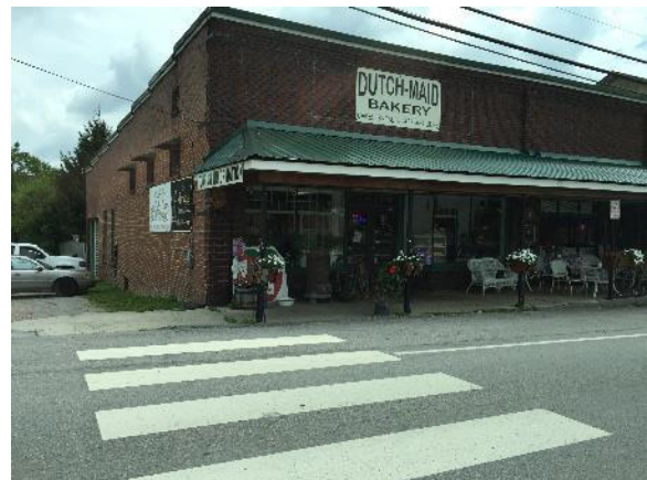
The Mountain Goat Trail will cross a busy U.S. highway near the famous Dutch Maid Bakery. Ensuring safe walking conditions on local streets and highways is important to the trail's success.