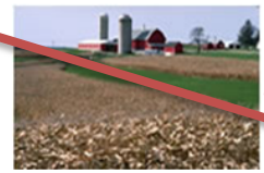
Accreditation and Certification

What is organic? Organic production is a system that is managed in accordance with the Organic Foods Production Act (OFPA) of 1990 (PDF) and regulations in Title 7, Part 205 of the Code of Federal Regulations to respond to site-specific conditions by integrating cultural, biological, and mechanical practices that foster cycling of resources, promote ecological balance, and conserve biodiversity. The National Organic Program (NOP) develops, implements, and administers national production, handling, and labeling standards.