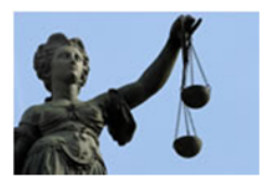
Compliance and Enforcement